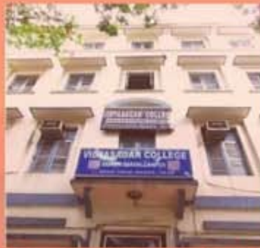
Bidhan Sarani Campus for UG Courses: 17 Bidhan Sarani, Kolkata- 700 006