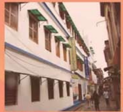
Main Campus for UG Courses 39 Sankar Ghosh Lane, Kolkata- 700 006