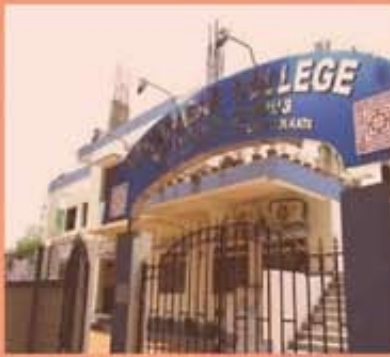
Salt Lake Campus for PG Courses: Block CL, Plot 3-8 & 44-50, Sector- II, Salt Lake, Kolkata- 700 091