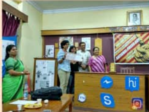
National Press Day Celebration on 17th November 2018 Students